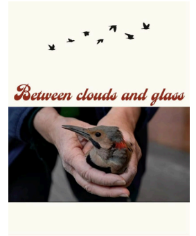
A showing of the 12-minute film Between Clouds and Glass , by Director Mykhailo Bogdanov .